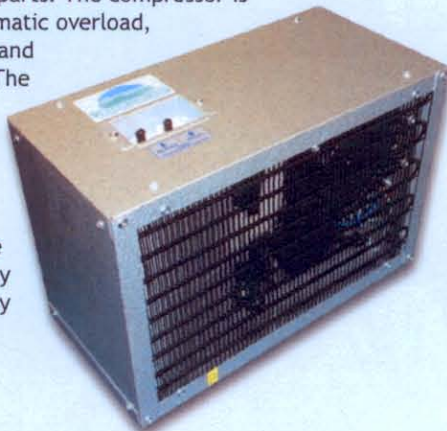
As part of Waterworks Australia's policy of continuous improvement, we reserve the right to alter specifications at anytime without notice.

This fan assisted, static condenser system utilises R134a refrigerant which is non toxic, non-flammable and non ozone depleting. Refrigerant flow is controlled by capillary tube, which has no moving parts. The compressor is protected by an automatic overload, is lifetime lubricated and hermetically sealed. The tube on tank style evaporator has six (6) windings around the storage tank for balanced, efficient cooling and the entire system is controlled by an adjustable, (factory pre-set), thermostat.