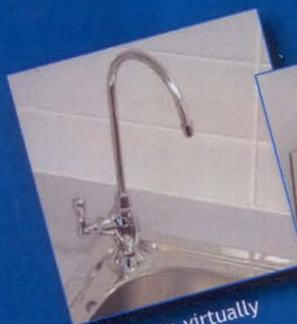
Connect to virtually any faucet