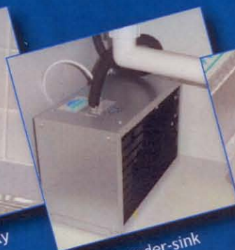
Ideal for under-sink installations