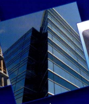
Offices and Corporate Buildings