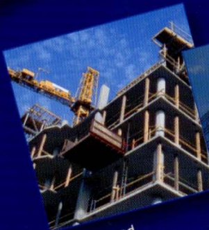
Building and Construction Sites

Design Registration No. 158110. Unit depicted has optional Glass Filler fitted.