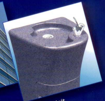
Standard Unit (bubbler only)